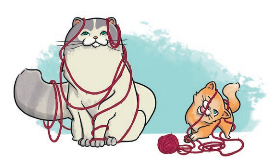
Muffin ruined dinner time.